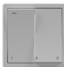
Control unit double rocker (inVENTer-Design or own switch range)